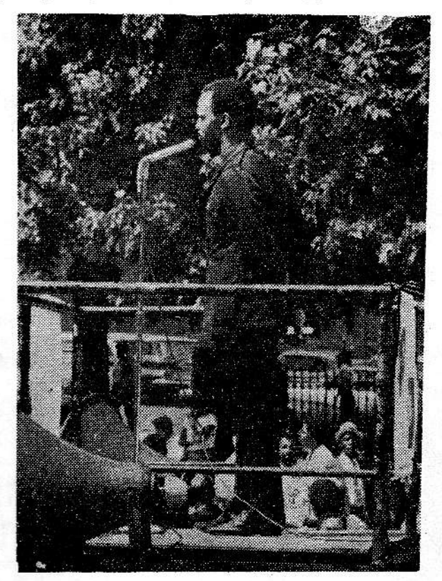
Geronimo in Harlem