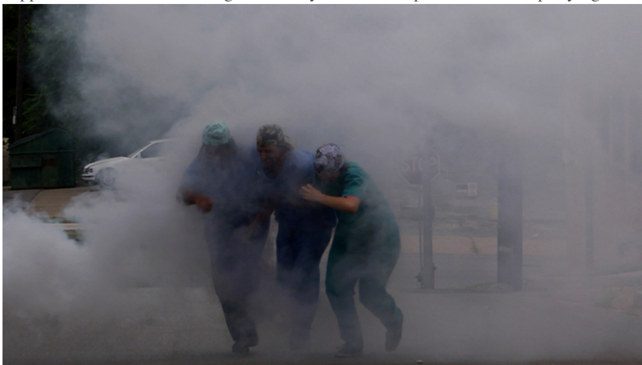
Stanya Kahn , Don't Go Back To Sleep , 2014, HD video with stereo sound, TRT 74 minutes, SVLAP solo exhibition, April 19 - May 24, 2014

The urgency precipitated upon catastrophe has dissipated among the doctors. Instead they wait, banter, and bottle milk, a substance that seems to be critical to a recovery and in short supply. Occasionally they perform surgery, singing songs like “I’ve Been Working on the Railroad.” While working inside the abdominal cavity of a patient only mildly anesthetized from a few swigs of mezcal, one doctor describes her surgical methodology to be “like popping a zit.” What would normally be a doctor’s primary professional function is secondary to their interactions with each other and how they cope with the passage of time. Post-surgery, the doctors and their patient hang out and relax on a big sectional couch. Unconcerned that the patient looks like the star of a remake of Weekend at Bernie’s , the two doctors share stories from recurring dreams each looking to the other to validate their interpretation. It’s the type of stupid yet resonant conversation that happens at 4am in the morning after everyone else has passed out from partying or fatigue.