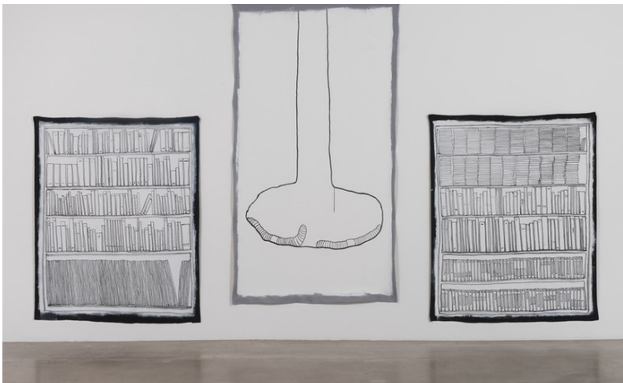
Stanya Kahn , Don't Go Back To Sleep , Installation view, SVLAP Solo exhibition, April 12 - May 24, 2014; Photo: Robert Wedemeyer / Courtesy of the Artist and SUSANNE VIELMETTER LOS ANGELES PROJECTS

The drawings are lighter in both content and craft than the video. Kahn's sense of humor and plays on word and image are inversely proportionate to polish. All black and white with very few details or backgrounds they seem like sketches, character studies, notes on or fragments of larger ideas that get worked out elsewhere. In a series of portraits of women with t-shirts that read "Mayhem" or "Fuck shit up" the meek and placid expressions of the sitters explicitly betray the message on their shirt. This joke does not end at irony; instead it becomes tension and intrigue, a battle between, to quote from the best group of drawings in the show, "that witch is above" and "that witch is below."