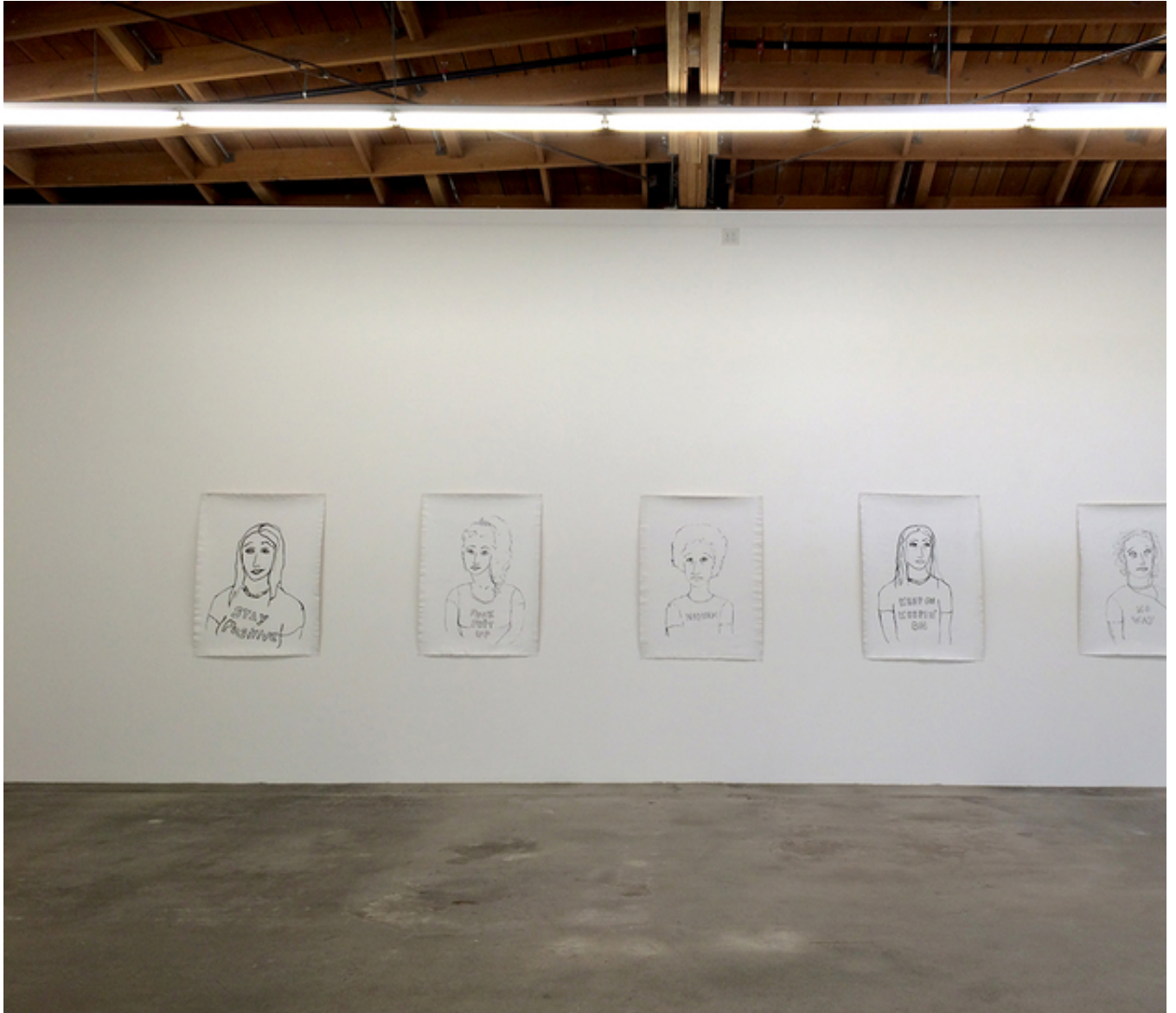
Stanya Kahn, "Don't Go Back to Sleep," 2014