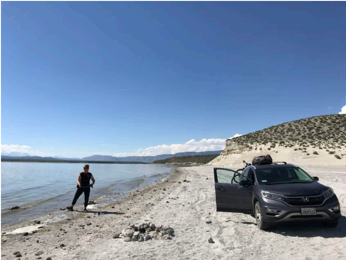
Second production vehicle couldn't make it to this off-road location We left the boys and just took the girls to get the shot