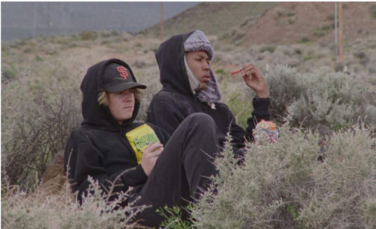
Still from Stanya Kahn, No Go Backs , 2020, color digital video with sound.

Pressurized states of being and strategies of survival.