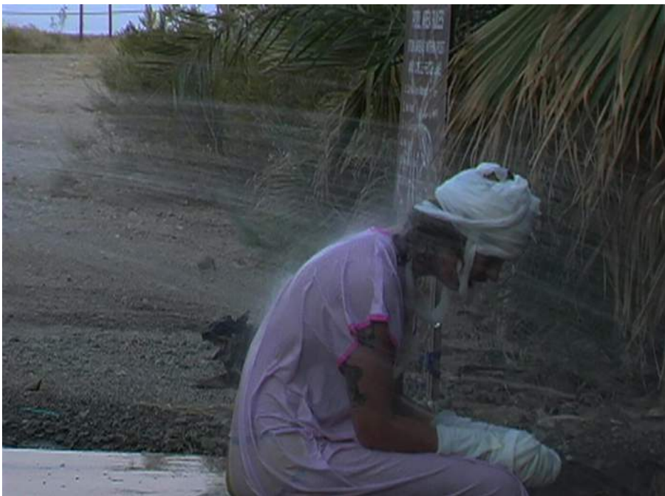
Still from Stanya Kahn, It's Cool, I'm Good , 2010, color digital video with sound.

For me, a start to defining the politics of No Go Backs might be that every reviewer has forgotten or neglected the fact that Kahn is invisibly on this journey with Lenny and Elijah. She too is hot, cold, sore, bug-bitten, optimistic, bloodied, exposed, aware of the privilege of movement, and only partially protected by the camera. This kind of emotional and visual simultaneity is characteristic of all of Kahn’s work, most notably Stand in the Stream (2011–17), a documentary filmic collage of recent activist movements that also follows the deteriorating health of Kahn’s activist mother