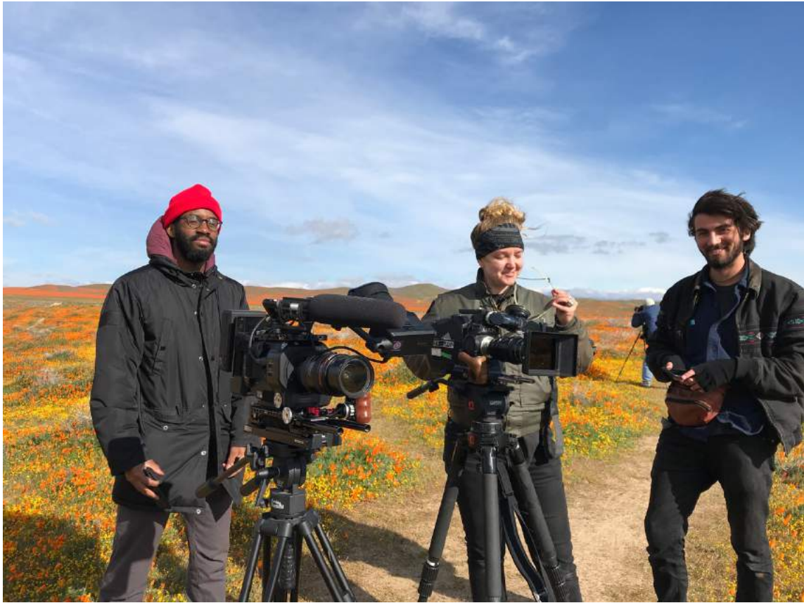
No Go Backs, first day of filming, setting up first shot. PA Chester Toye, co-DP Consuelo Althouse, Second Camera Simon Gulergon