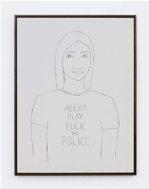
Stanya Kahn, Alexa Play Fuck the Police , 2019, ink and gesso on canvas. Courtesy of the artist and Vielmetter Los Angeles. © Stanya Kahn.