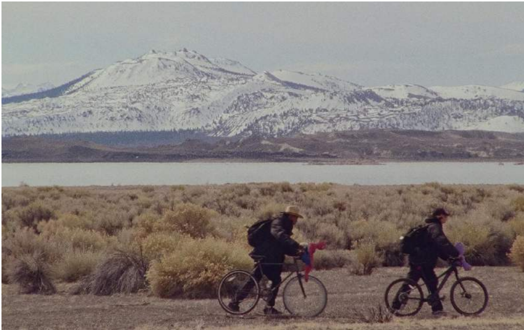
Stanya Kahn, No Go

relentlessly disquieting tone of these proceedings undergoes radical tempering in the artist's latest video, No Go Backs (2020). Here, the action unfolds without a single word spoken.