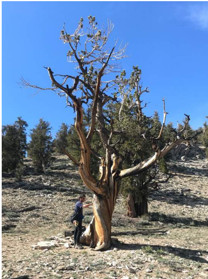
Simon touching one of the oldest trees on earth