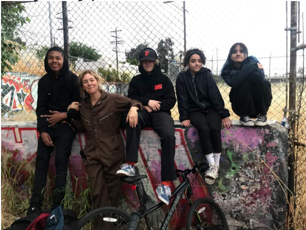
With the kids in the city