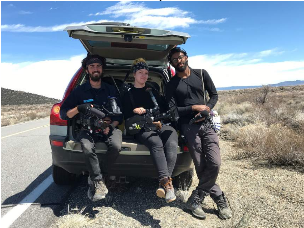
Super crew: Simon Gulergun, asst. camera, Consuelo Althouse co-DP, Chester Toye, PA