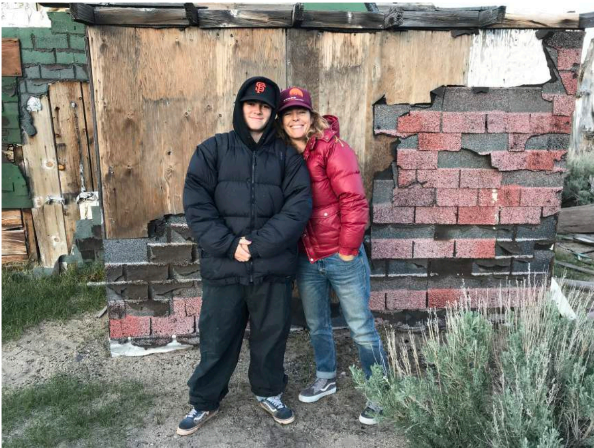
Directing and filming my own kid was a dream. He cast all his friends in the film.