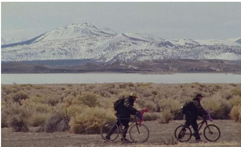
Still from Stanya Kahn, No Go Backs , 2020, color digital video with sound.