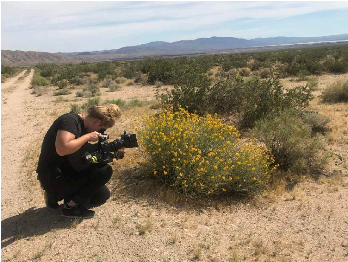
Conci shooting wildflowers