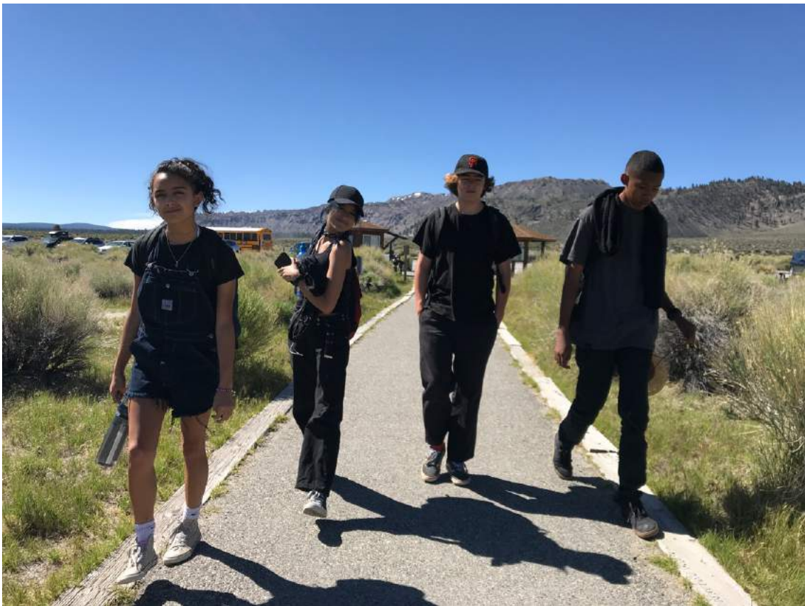
Our four stars