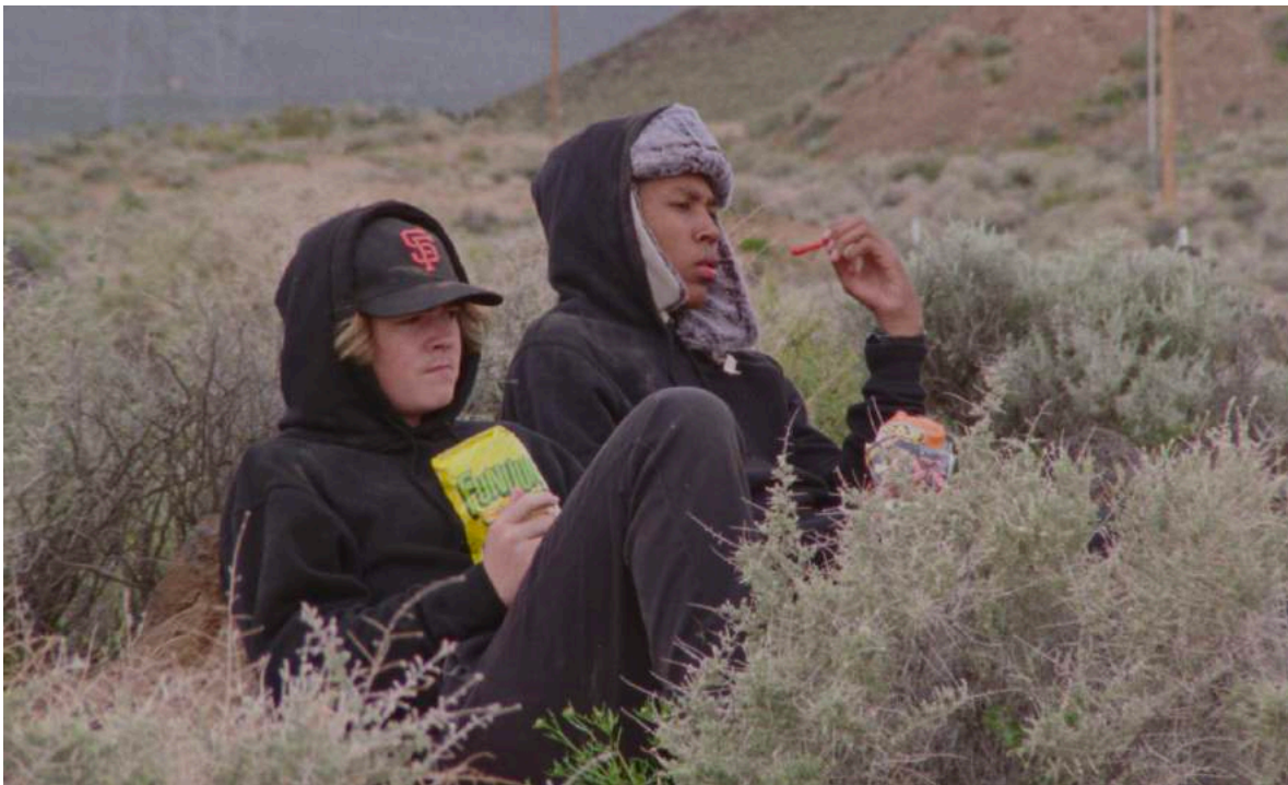
Stanya Kahn, "No Go Backs" (2020), video still, 16mm film transferred to 2k video (color, sound), 33:13 minutes (all images © 2020 Stanya Kahn, courtesy the artist and Vielmetter Los Angeles)

In Stanya Kahn's earlier films, Los Angeles seems ready to spark a revolution at any moment. But in the newest adventure, the urban sprawl creeps into the inhabitants' states of mind, and everything languishes.