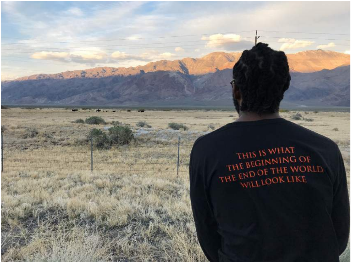
Chester taking a break