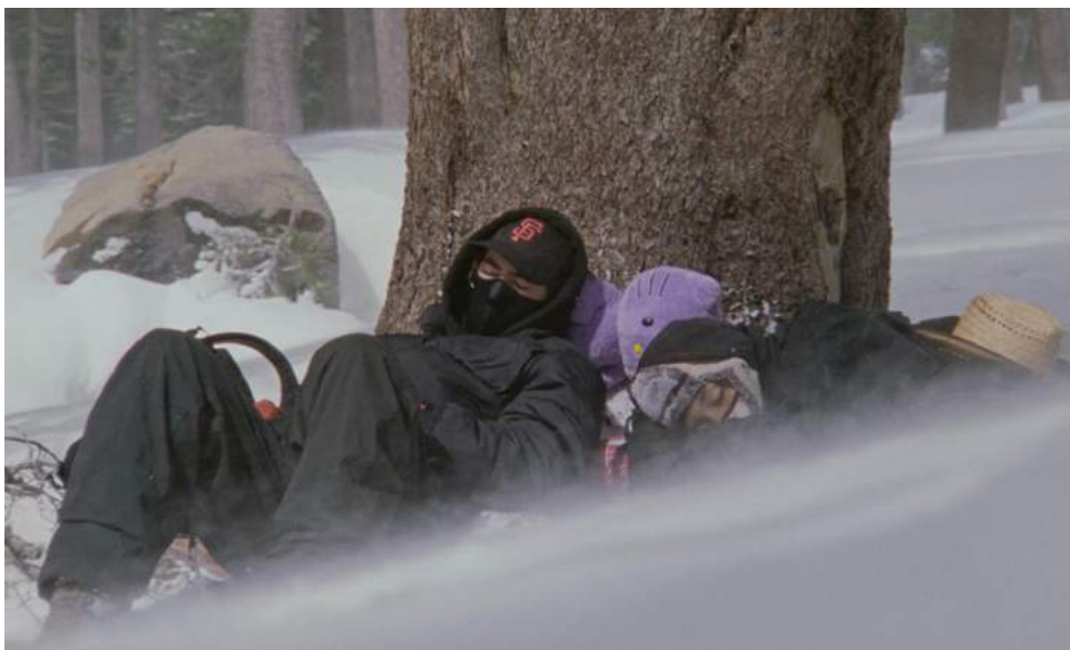
Still from Stanya Kahn, No Go Backs , 2020, color digital video with sound. Courtesy of the artist and Vielmetter Los Angeles. © Stanya Kahn.

Kahn generously allowed me to watch her new short film No Go Backs (2020) in her studio months before quarantine and the renewed call to defund the police. The film, which stars Lenny and his friend Elijah, is grand in scale and in its emotional heft, with no dialogue and only a haunting soundscore. Kahn follows the teenagers as they make their way through bleak and beautiful California landscapes—“Man” or “boys” against the elements—and trace a terrain pockmarked by more than a century of conflicts over water. Sometimes masked—as if perhaps they have fled a pandemic or have gone