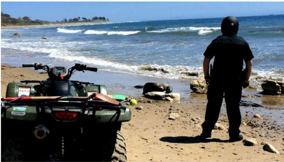
Still from Stanya Kahn, Stand in the Stream , 2011–17, color digital video with sound.

There's a way all three works are connected. They're each sort of dreamlike narratives with critical issues embedded inside them, from the more metaphoric It's Cool, I'm Good , in which a severely injured protagonist traverses the traumatized geography of LA, to the more dense, kaleidoscopic docufiction Stand in the Stream , shot over the course of six years and following shifts in political movements, digital landscapes, the raising of a son, and the death of a mother. All of them invoke pressurized states of being and strategies of survival, which is clearly what I'm most obsessed with. Ha, ha.