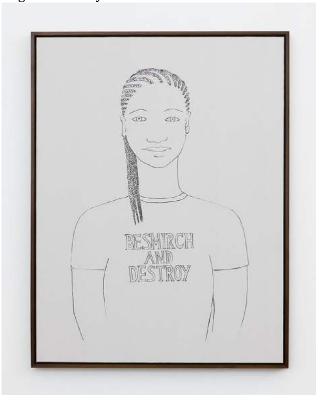
Stanya Kahn, Besmirch and Destroy , 2019, ink and gesso on canvas.