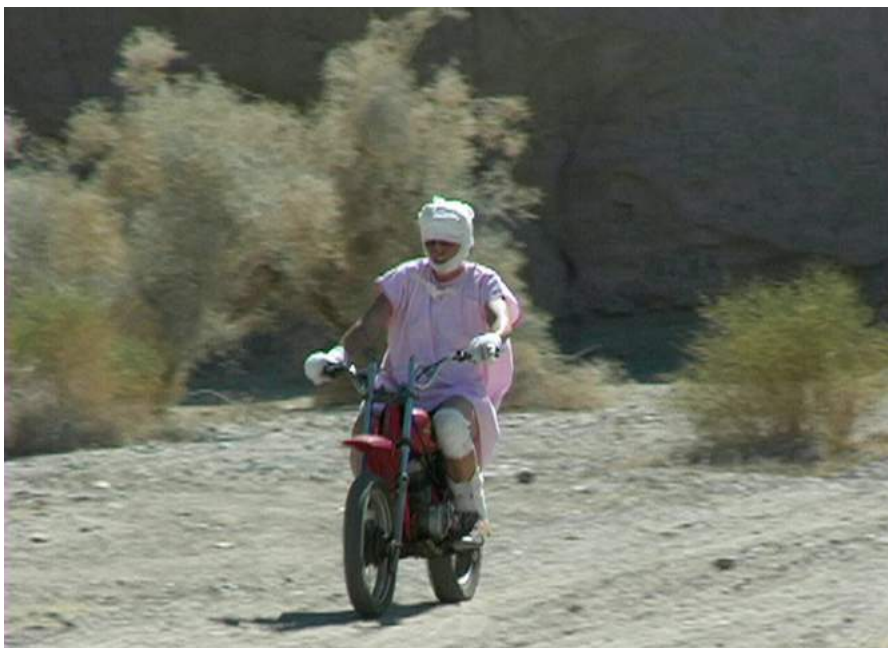
Still from Stanya Kahn, It's Cool, I'm Good , 2010, color digital video with sound. Courtesy of the artist and Vielmetter Los Angeles. © Stanya Kahn.

In It's Cool, I'm Good (2010), we do see Kahn's wounds, though in this case they are fictionalized, and we do not know their source. Kahn, entombed in bandages, braces, and oozing prosthetics, clumsily (but charmingly perhaps) hits on her various nurses. At one point, the camera lingers on Kahn's exposed back covered in flies, as if she were already a carcass. Her intermixing of footage of police responding to some unknown crime on the ground and in the ubiquitous helicopters overhead suggests that any erotics associated with Los Angeles—freedom, hot lesbians everywhere, a yard, a car that can take you out of town, flirting in a desolate Wienerschnitzel parking lot, a liberal utopia—are bandaged, encased by airborne spotlights and Ford Crown Victorias. Those agents of motion, these agents of violence, as we have seen, as Kahn and Lenny saw firsthand, are as much a part of any portrait of Los Angeles as the land and the sunset.