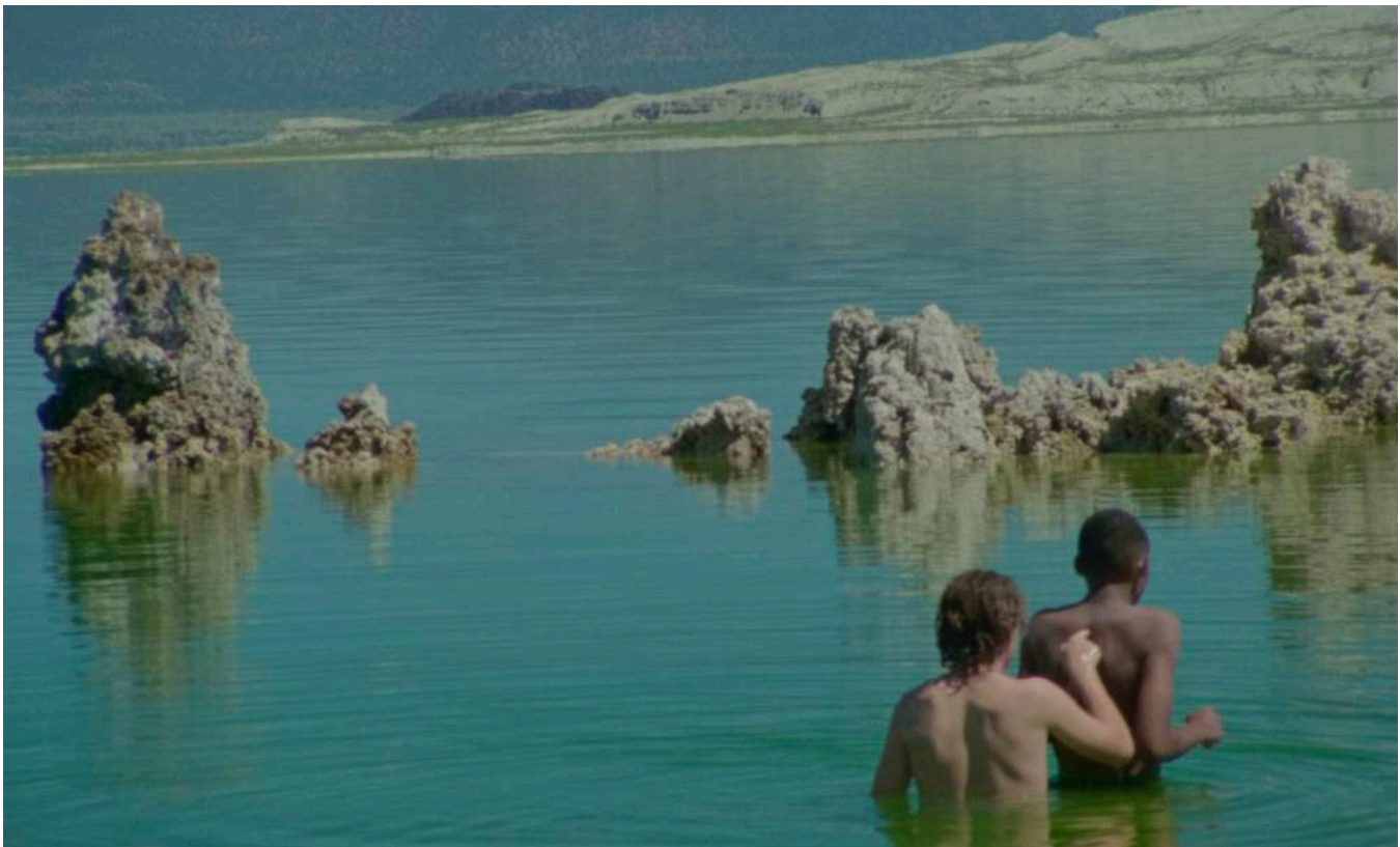
Stanya Kahn, "No Go Backs" (2020), video still, 16mm film transferred to 2k video (color, sound), 33:13 minutes

But while Stand in the Stream and It's Cool, I'm Good operate with a sense of urgency, the teenagers in No Go Backs are ambivalent, restless, and bored. They take the scenic route, backfloat in a swimming hole, and laze against towering rock formations while watching a vulture glide in the air, searching for scraps. They live in a world without responsibility, awaiting future homes that are abandoned, scorched from forest fires. In Kahn's earlier films, Los Angeles seems static-charged, ready to spark into revolution or flames at any moment. But in the newest adventure, the insurmountable urban sprawl creeps into the inhabitants' states of mind, and everything languishes; there's too much ground to cover, too much time to kill, and not enough activity to spin into a distraction.