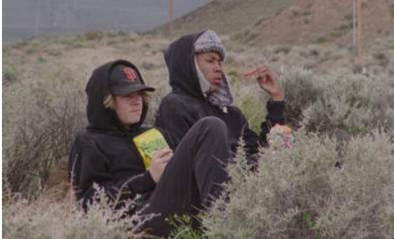
Stanya Kahn: No Go Backs , 2020, super 16 mm film transferred to video, 33 minutes, 30 seconds.