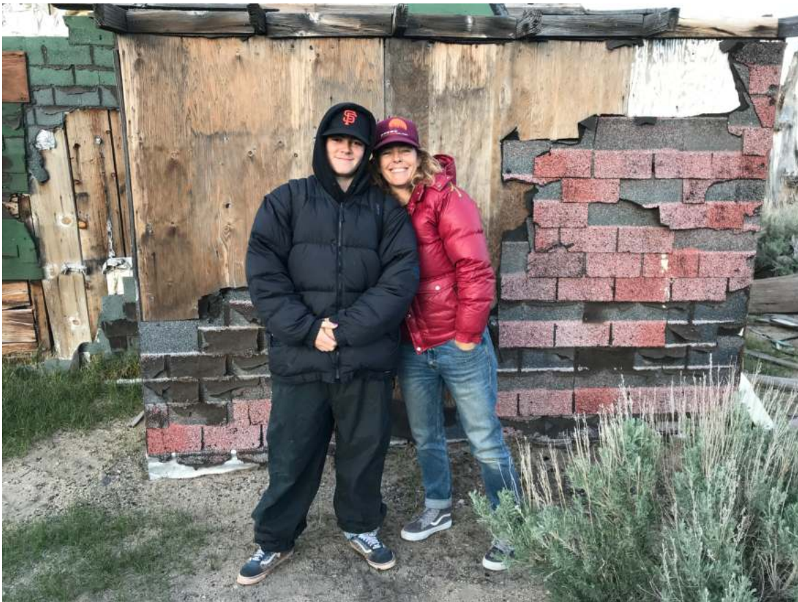
Directing and filming my own kid was a dream. He cast all his friends in the film.