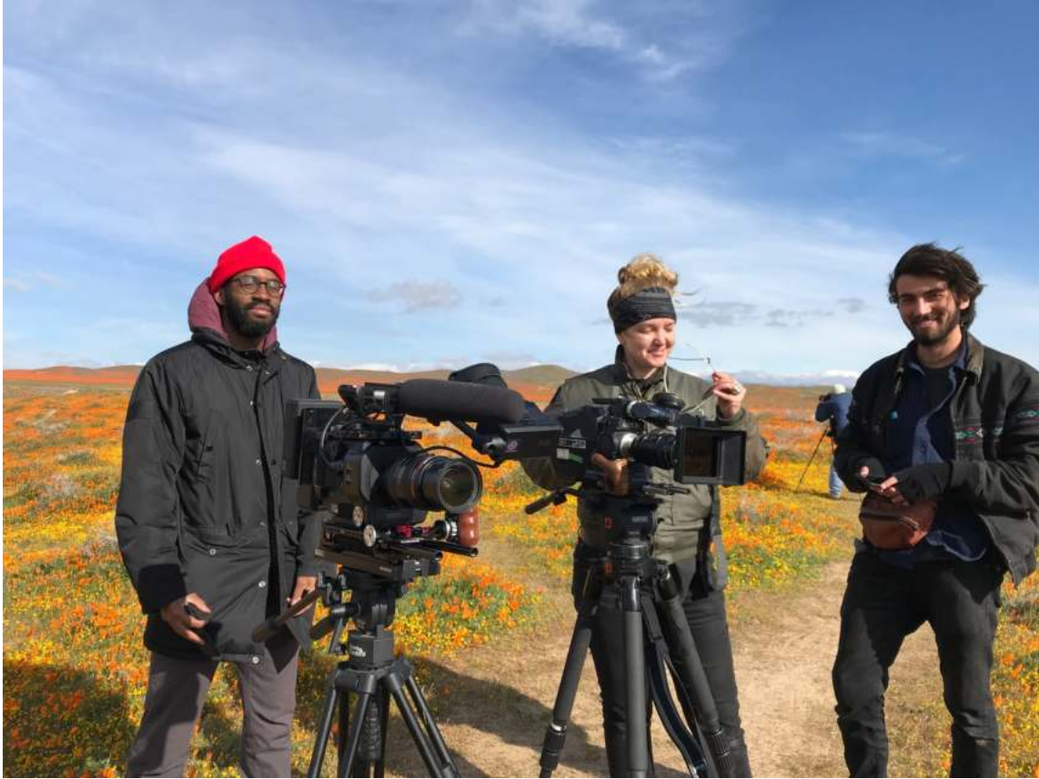
No Go Backs, first day of filming, setting up first shot. PA Chester Toye, co-DP Consuelo Althouse, Second Camera Simon Gulergon