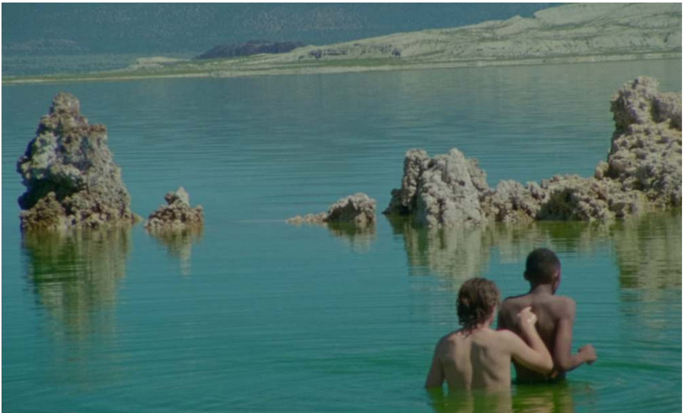
Stanya Kahn, "No Go Backs" (2020), video still, 16mm film transferred to 2k video (color, sound), 33:13 minutes

But while Stand in the Stream and It's Cool, I'm Good operate with a sense of urgency, the teenagers in No Go Backs are ambivalent, restless, and bored. They take the scenic route, backfloat in a swimming hole, and laze against towering rock formations while watching a vulture glide in the air, searching for scraps. They live in a world without responsibility, awaiting future homes that are abandoned, scorched from forest fires. In Kahn's earlier films, Los Angeles seems static-charged, ready to spark into revolution or flames at any moment. But in the newest adventure, the insurmountable urban sprawl creeps into the inhabitants' states of mind, and everything languishes; there's too much ground to cover, too much time to kill, and not enough activity to spin into a distraction.