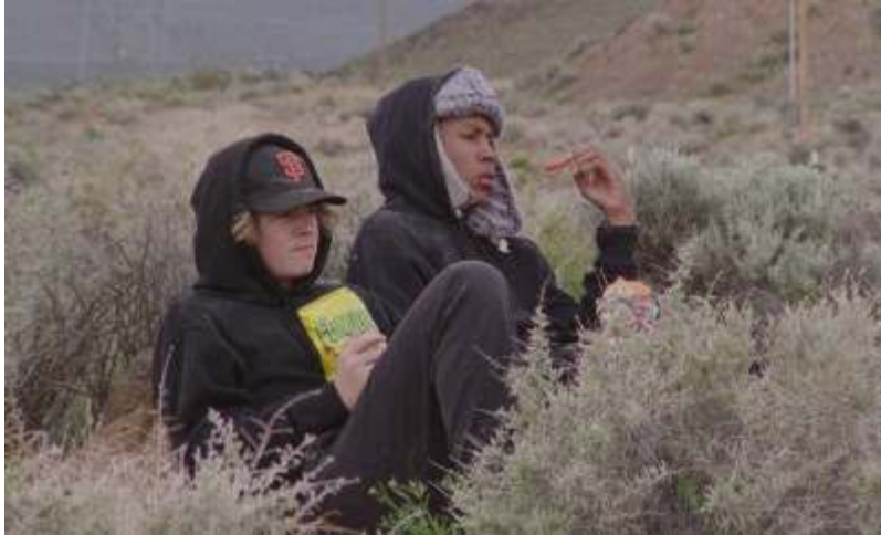
Stanya Kahn: No Go Backs , 2020, super 16 mm film transferred to video, 33 minutes, 30 seconds.