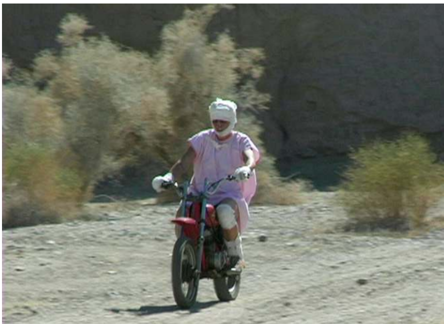
Still from Stanya Kahn, It's Cool, I'm Good , 2010, color digital video with sound.

In It's Cool, I'm Good (2010), we do see Kahn's wounds, though in this case they are fictionalized, and we do not know their source. Kahn, entombed in bandages, braces, and oozing prosthetics, clumsily (but charmingly perhaps) hits on her various nurses. At one point, the camera lingers on Kahn's exposed back covered in flies, as if she were already a carcass. Her intermixing of footage of police responding to some unknown crime on the ground and in the ubiquitous helicopters overhead suggests that any erotics associated with Los Angeles—freedom, hot lesbians everywhere, a yard, a car that can take you out of town, flirting in a desolate Wienerschnitzel parking lot, a liberal utopia—are bandaged, encased by airborne spotlights and Ford Crown Victorias. Those agents of motion, these agents of violence, as we have seen, as Kahn and Lenny saw firsthand, are as much a part of any portrait of Los Angeles as the land and the sunset.