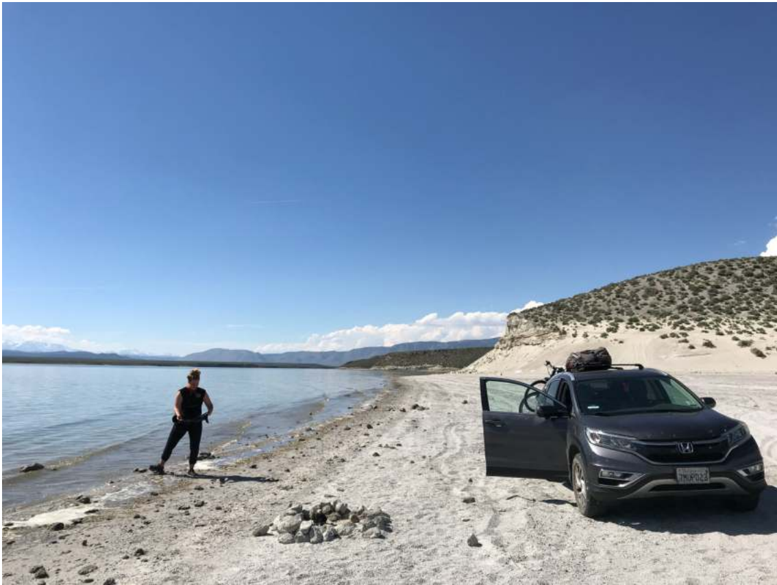
Second production vehicle couldn't make it to this off-road location We left the boys and just took the girls to get the shot