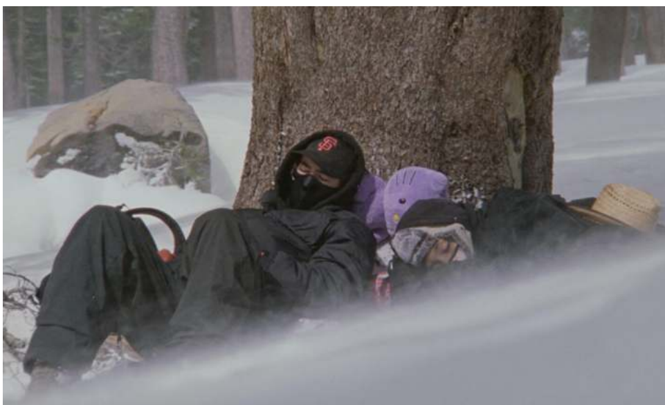
Still from Stanya Kahn, No Go Backs , 2020, color digital video with sound.

Kahn generously allowed me to watch her new short film No Go Backs (2020) in her studio months before quarantine and the renewed call to defund the police. The film, which stars Lenny and his friend Elijah, is grand in scale and in its emotional heft, with no dialogue and only a haunting soundscore. Kahn follows the teenagers as they make their way through bleak and beautiful California landscapes—“Man” or “boys” against the elements—and trace a terrain pockmarked by more than a century of conflicts over water. Sometimes masked—as if perhaps they have fled a pandemic or have gone