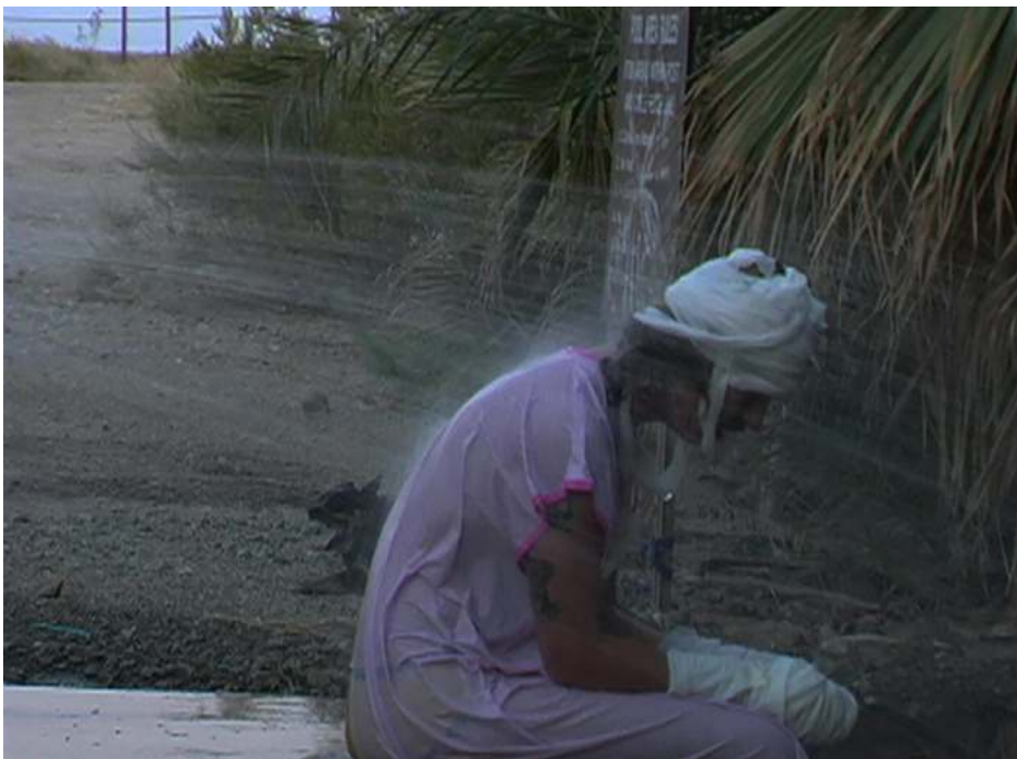
Still from Stanya Kahn, It's Cool, I'm Good , 2010, color digital video with sound. Courtesy of the artist and Vielmetter Los Angeles. © Stanya Kahn.

For me, a start to defining the politics of No Go Backs might be that every reviewer has forgotten or neglected the fact that Kahn is invisibly on this journey with Lenny and Elijah. She too is hot, cold, sore, bug-bitten, optimistic, bloodied, exposed, aware of the privilege of movement, and only partially protected by the camera. This kind of emotional and visual simultaneity is characteristic of all of Kahn’s work, most notably Stand in the Stream (2011–17), a documentary filmic collage of recent activist movements that also follows the deteriorating health of Kahn’s activist mother