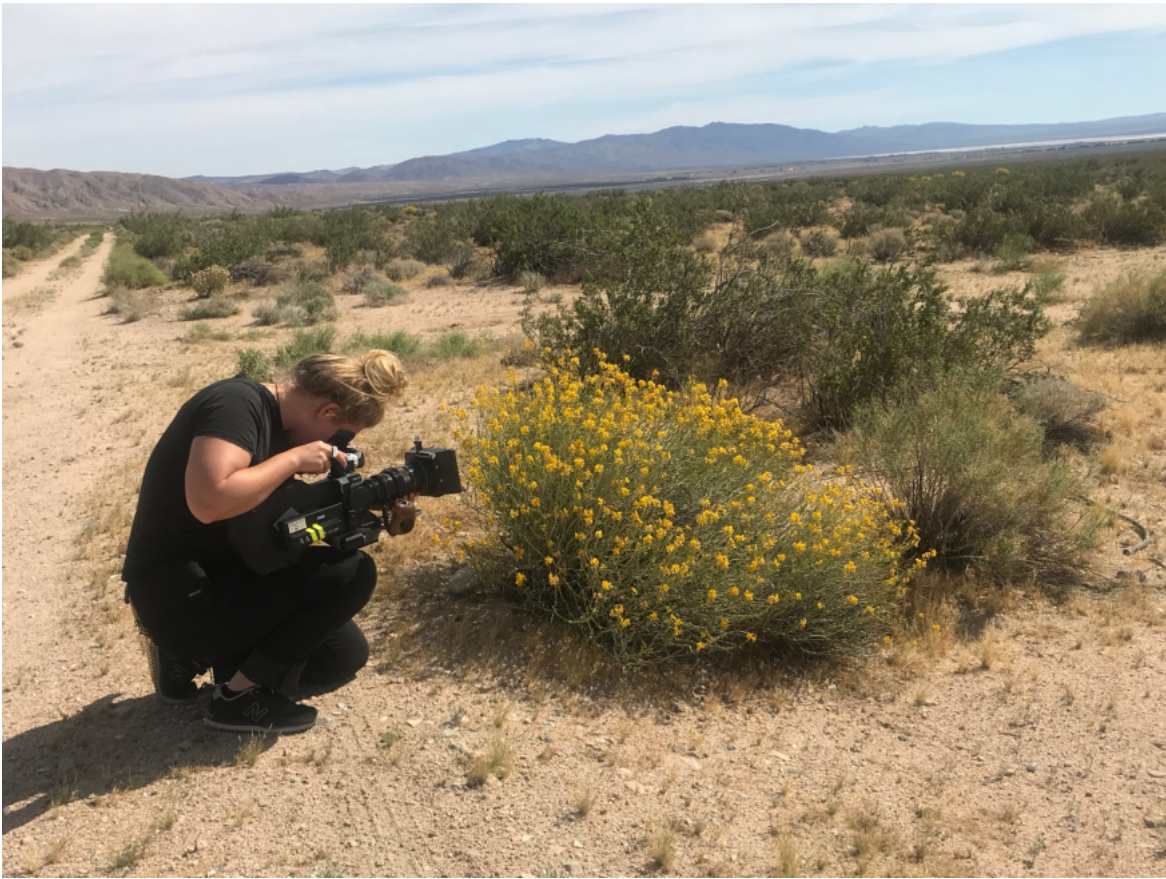
Conci shooting wildflowers