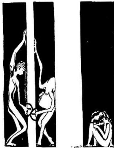
Drawing by SuSun Young, C.I.W. Poetry Journal