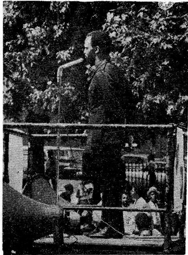
Geronimo in Harlem